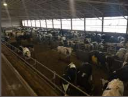
Beef Symposium - 2017