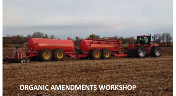
ORGANIC AMENDMENTS WORKSHOP

Saturday January 21, 2017 Rozanski Hall, University of Guelph, Ontario, Canada