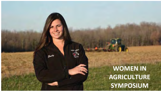
WOMEN IN AGRICULTURE SYMPOSIUM